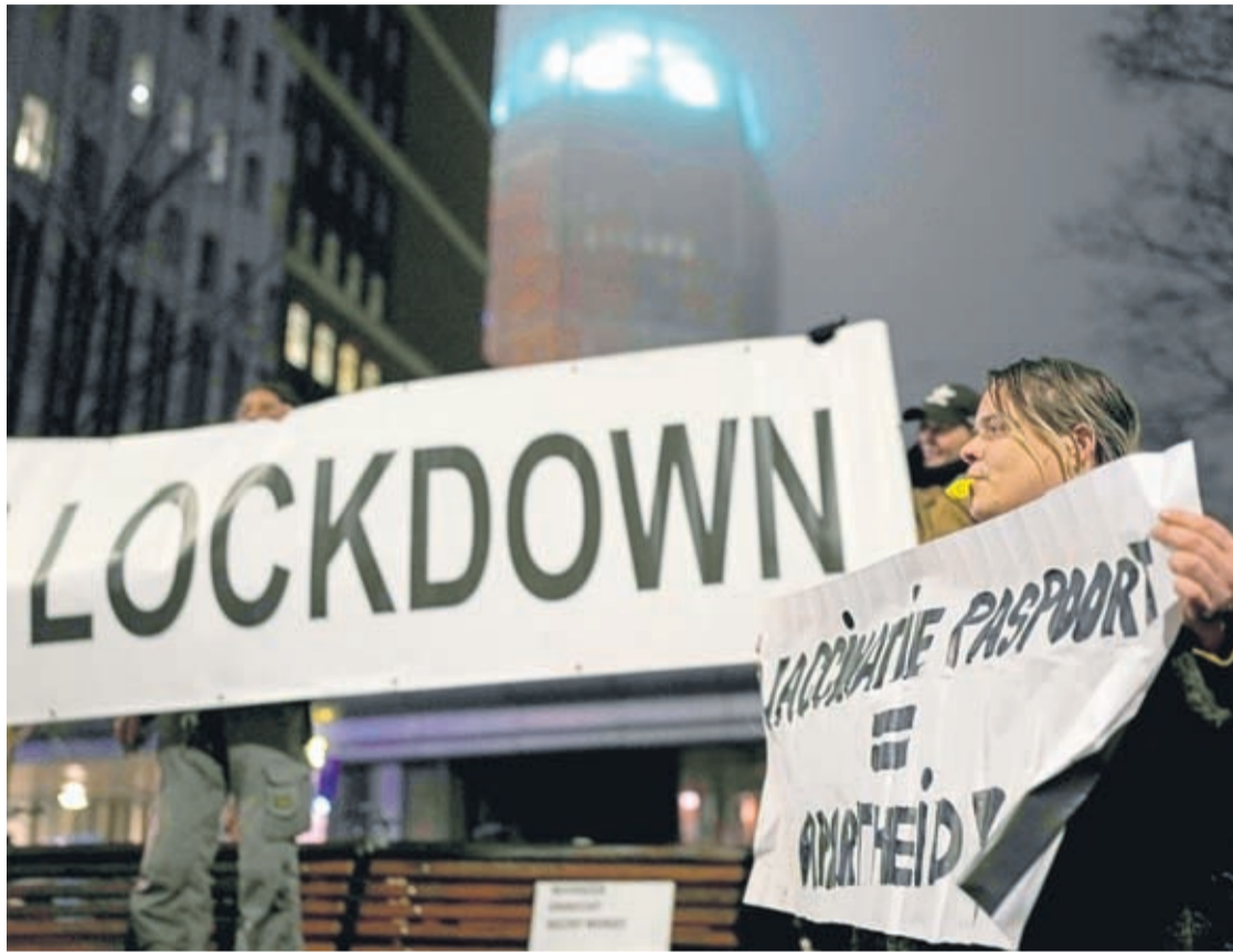
A protestor holds a banner during a small anti-COVID restriction demonstration in the Hague, the Netherlands, Saturday, Dec. 18, 2021.

Thousands of opponents of vaccine requirements and mask mandates protested Saturday in Hamburg, Berlin, Düsseldorf and other German cities. In Austria, local media reported the crowds swelled to tens of thousands. □